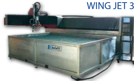
WING JET 3020

Demonstration during the Open House: dynamic cutting on TITANIUM